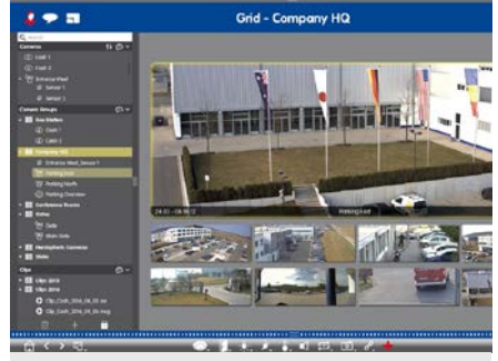
Tree layout structure

The new device bar displays a new tree structure in all layout views and supports a clear