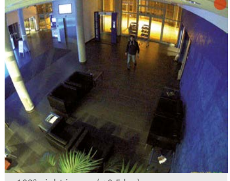
103° night image (< 0.5 lux)